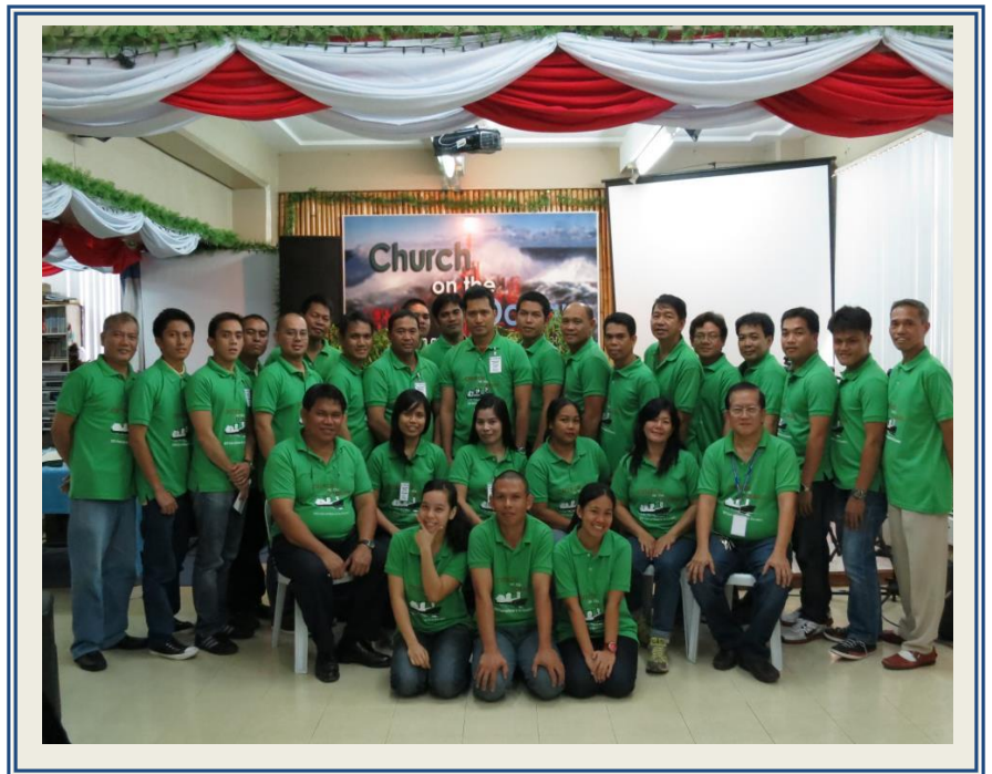
Seafarers who have committed to study God's word and share it on the oceans of the world. Manila, Philippines.

While preparing this newsletter, I noticed the many prayer requests we have listed, you have prayed about, and God has answered. From God's willingness to use his Word to change lives, to his financial provision for this mission, He is faithful. Last winter we requested prayer for a new air conditioner. This year, it is answered prayer. Last year you prayed for God's word to move here at Anchor House. Since then, not only seafarers but port employees have chosen to hear God's word regularly at a prayer breakfast/study before work. We have requested prayer for seafarers to be willing to be the "Church on the Ocean." Literally, a Christian influence in their workplace and living space while at sea. Photo on the right: another group of graduates from this program!